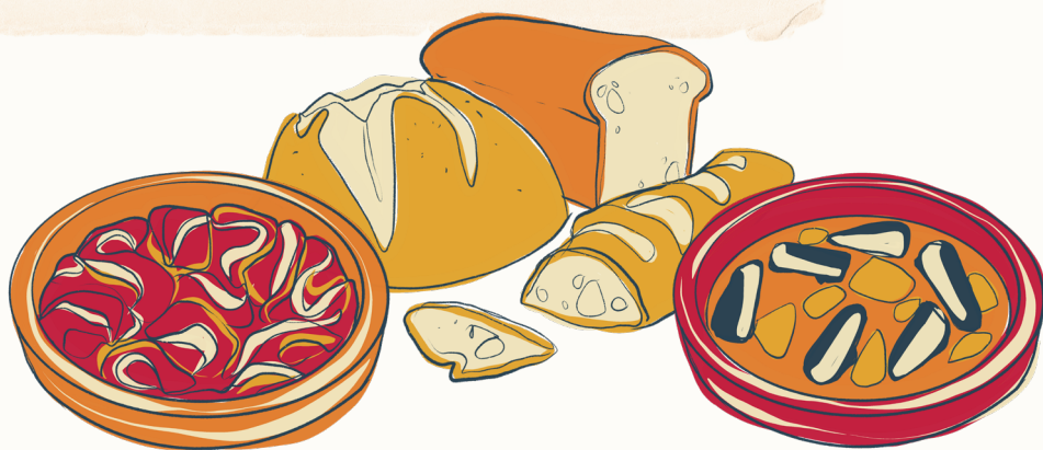
Esgarraet o esgarrat